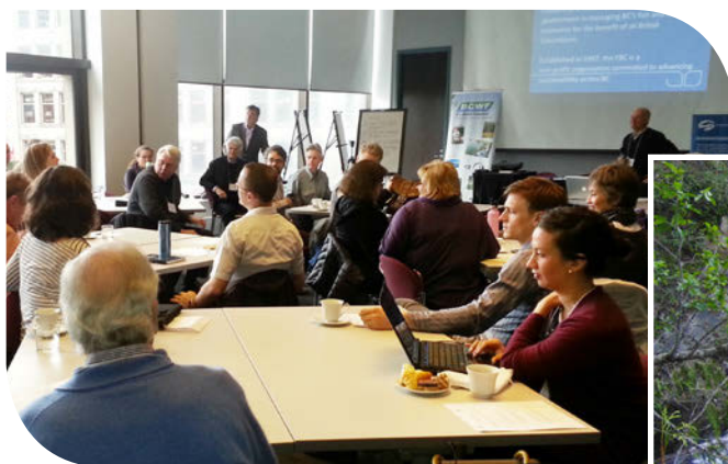
March 2014 "Advancing Watershed Sustainability in BC" workshop

The 2014 Salish Sea Ecosystem Conference in Seattle was a big success, attended by 1,200 delegates from Canada and the United States. Co-hosted by Western Washington University, the Puget Sound Partnership and the Fraser Basin Council, with funding from Environment Canada and others, the conference presented the latest scientific research on the state of the Salish Sea ecosystem as a foundation for its protection and restoration.