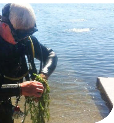
A diver examines Eurasian watermilfoil. Management of this invasive species is a priority under the Nicola Lake Action Plan.

Other priorities are to learn more about nutrients coming into the lake and tributaries and to reduce lakeshore erosion at Monck Provincial Park. Visit nicolaplan.ca .