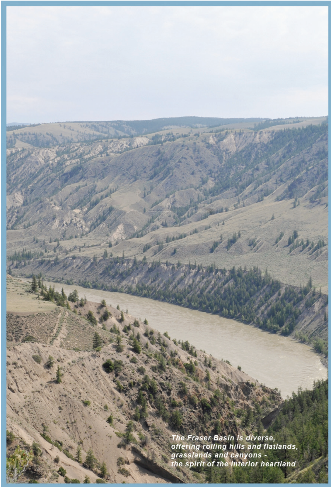
The Fraser Basin is diverse, offering rolling hills and flatlands, grasslands and canyons - the spirit of the Interior heartland