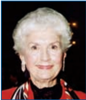
Iona Campagnolo, Lieutenant-Governor of British Columbia and Former Chair, Fraser Basin Council

“The achievements of these Sustainability Award winners embody what sustainability is all about, and stand as an inspiration to others to continue working towards a Fraser River Basin where social, economic and environmental sustainability are all in balance.”