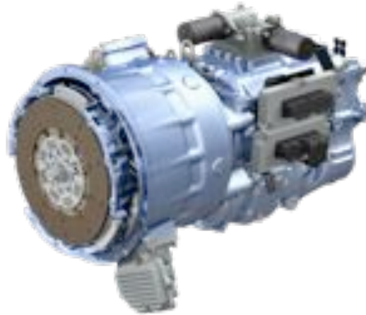
Hybrid Drive Unit (HDU)