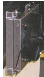
Hybrid Cooling System