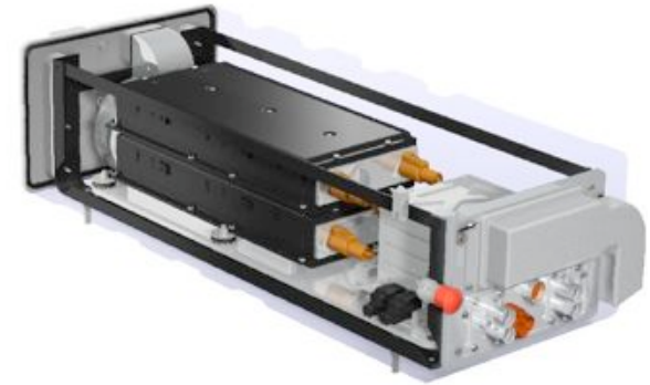
Power Electronics Carrier (Battery Box)