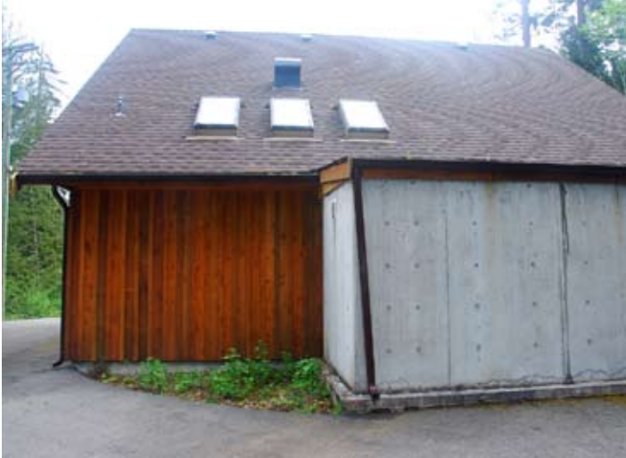
The well-kept Nanoose station replaced the old failing septic systems with collection pipes, a pump station, the treatment facility and 2.2 km ocean outfall.