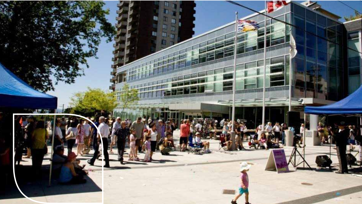
City of North Vancouver Civic Plaza