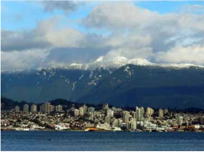
View of the City of North Vancouver from an approaching seabus showing a variety of housing types, mixed use commercial spaces and the transportation hub of the SeaBus terminal at Lonsdale Quay.

“Arriving by transit on a beautiful spring day, I travelled to meet the CNV staff by SeaBus. What a great way to experience one of the ‘edges’ of this City! Crossing through a bustling working harbour with float planes landing and barges pressing freight through the water, the magnificent old bridge to my left, the City rising up to meet beautiful green mountains ahead of me. I really felt that one of the key defining elements of this place was its relationship with the ocean via Georgia Strait and Burrard Inlet. I realized the water linked it even to my home place in Victoria. I was looking forward to seeing how the City recognized and honoured it’s place at the water’s edge.” — Angela Evans