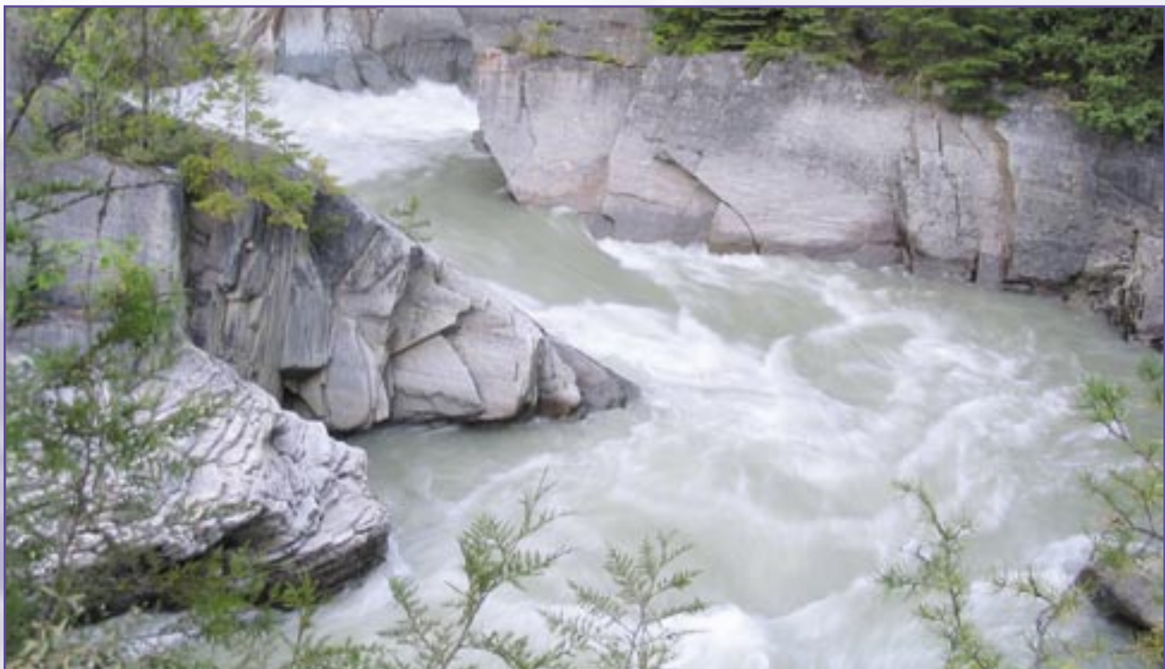
Ground water and surface water are interdependent.