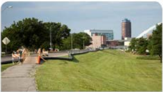
Levee with Roadway