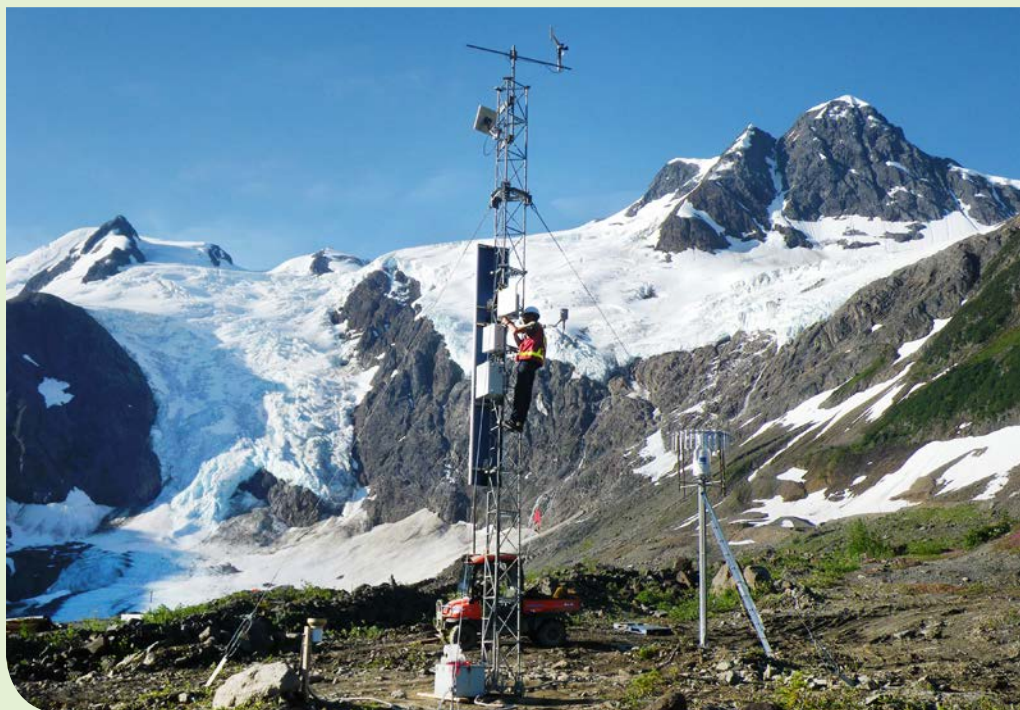
Figure 5 | Galore Creek weather monitoring station in West Fork of Galore Valley