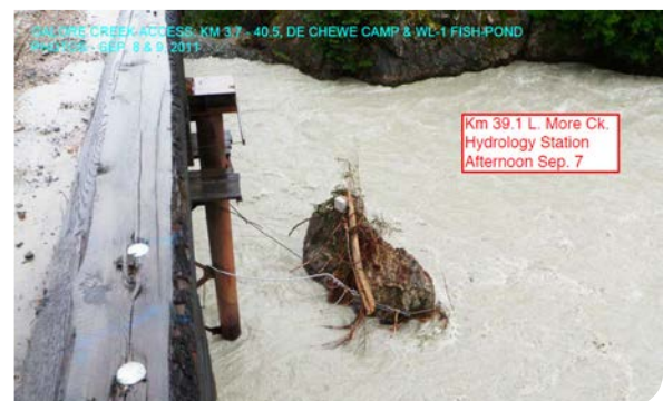
Figure 3 (top) | Flooding of access road