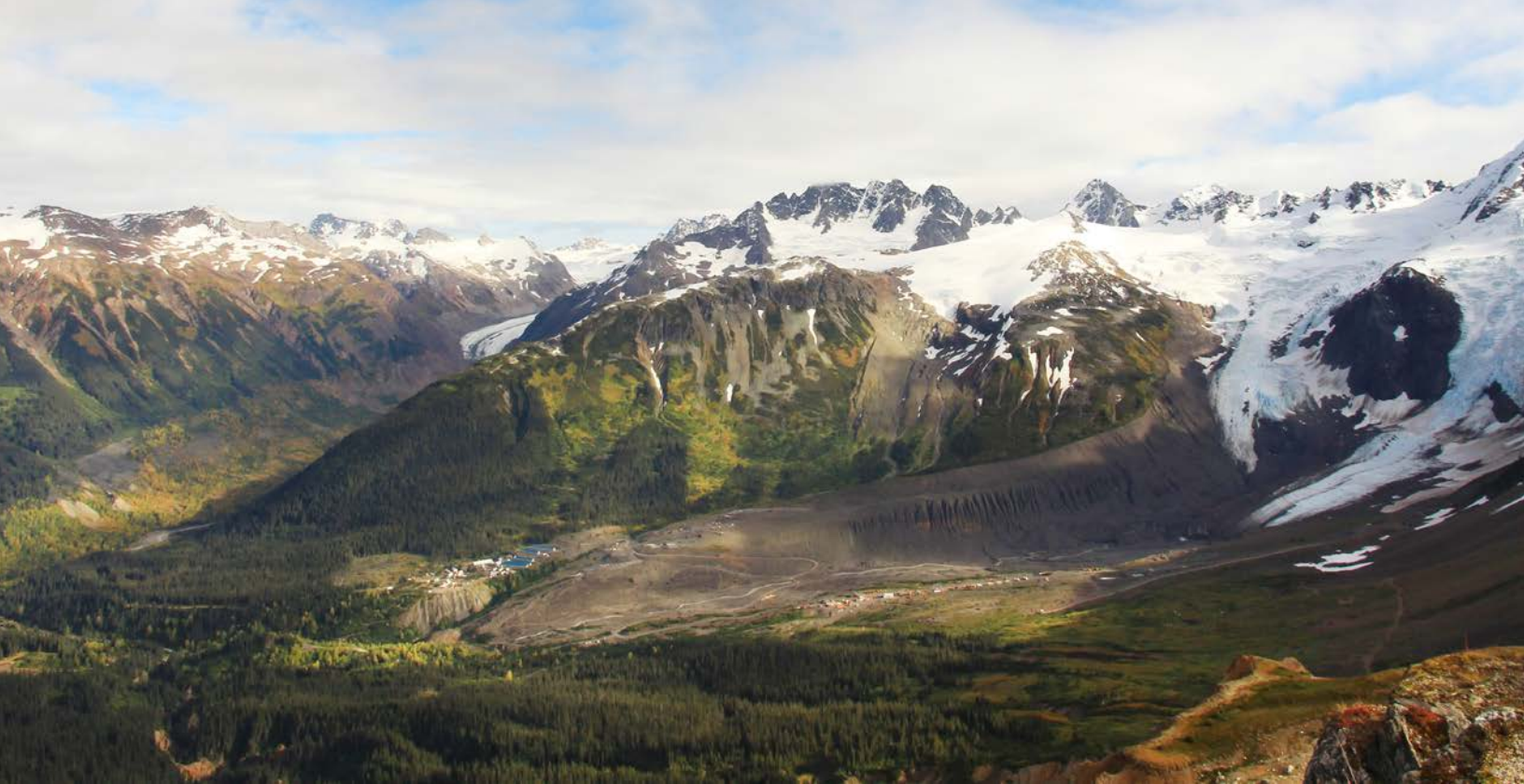
Figure 2 | View of Galore Creek West Fork & Utlahn camp in foreground, East Fork in background