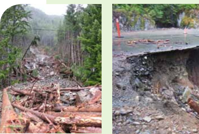
of debris flow in vicinity of Nyrstar Myra Falls mine

The 2006 flood event had major financial consequences for Breakwater Resources, the owner of the mine at the time. In addition to the $4M in lost production over the downtime period of five days plus start-up and the construction of a Bailey Bridge to restore the main access road, the company incurred costs of $250K for emergency pumping equipment. Subsequently, it cost the company approximately $550K to implement a pumping system designed to handle future events of a similar magnitude and $100K for a second effluent drainage line.