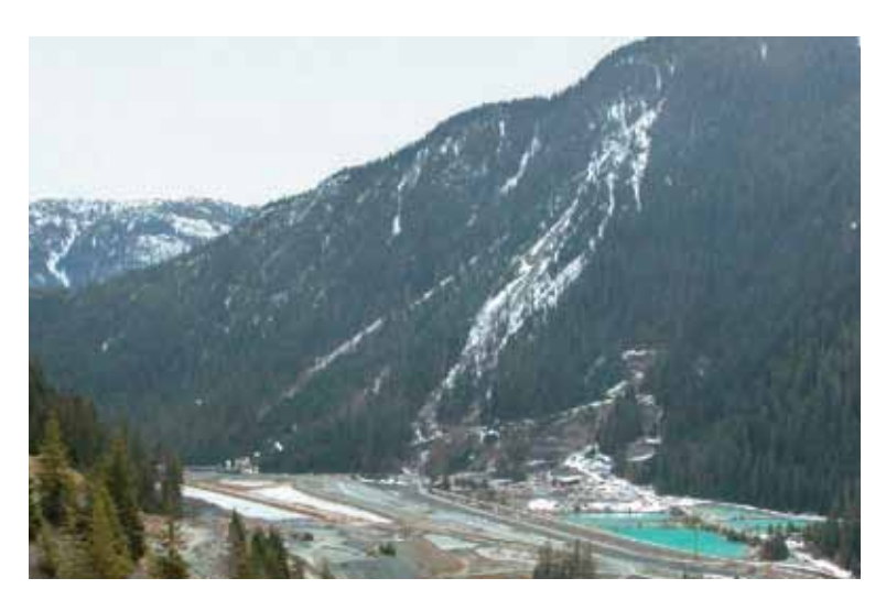
Figure 1 | Nyrstar Myra Falls Mine

Nyrstar is a multinational mining and metals corporation that specializes in zinc and lead extraction. Created in 2007 with the merger of Zinifex (an Australian mining company) and Umicore (a Belgian materials technology company), Nyrstar's operations now stretch across the globe with sites in the Americas, Australia, Europe and Asia. There are two mining operations in Canada: The Langlois mine in Northwestern Quebec and the Myra Falls mine in British Columbia.