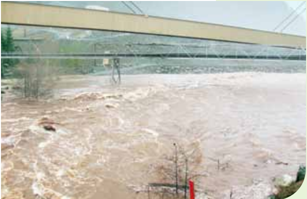
Figure 4 | Top: Normal rain event surface flows (August 2013) Bottom: November 2006 flows

The event caused extensive flooding (Figure 4) and debris flows (Figure 5), resulting in suspension of operations for five days and damage to key infrastructure including: