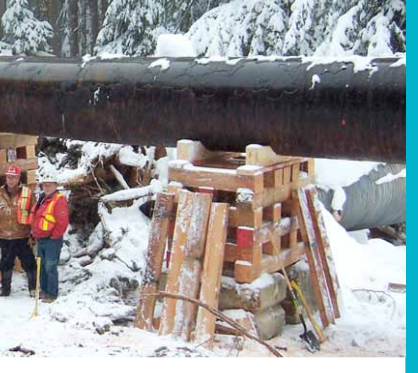
Figure 7 | Repair of damaged hydropower penstock footings