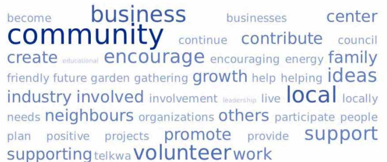
Figure 5.1: Sustainable Actions Cloudtag from ICSP Visioning Session